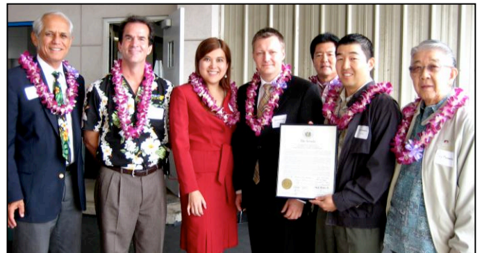
Sen. Gabbard honored Waipio's Tony Group Autoplex on February 23rd upon the blessing ceremony for a 298 kW solar electric system by REC Solar, which powers all 3 dealerships.

SB 1671 would align our energy policy with a clean energy and sustainable future by prohibiting new or expanded fossil fuel power plants beginning July 1, 2009. There would be an exemption for fossil-fuel based electric generation units of up to 2 MW (megawatts) for emergency purposes. If this bill passes into law, it will be the first in the nation.