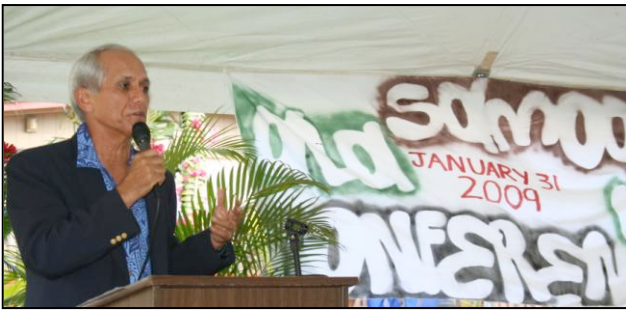
Sen. Gabbard addressed the audience at UH West Oahu's "Samoa Ala Mai Conference" on Saturday January 31, 2009.