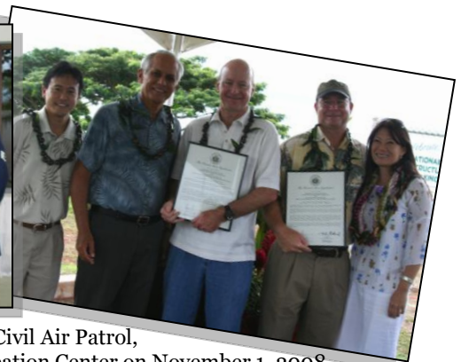
Left: LDS Makakilo Stake Grand Opening on November 8, 2008. Center: Civil Air Patrol, West Oahu Squadron on November 8, 2008. Right: Royal Kunia Community Association Recreation Center on November 1, 2008.