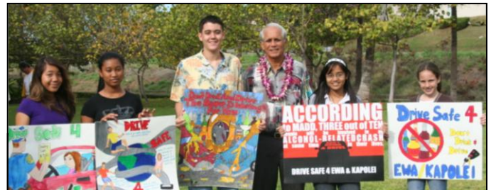
Young artists from Kapolei Middle & High schools were honored by Senator Gabbard at the Drive Safe 4 Ewa/Kapolei Kick-Off event at the Kapolei Police Station on November 29.

I'm pleased to announce that I've been named the Chair of the Senate Energy & Environment Committee. I'm excited to take the reins of this important committee, as we continue focusing on the protection of our natural environment, while moving away from our dependence on fossil fuels and increasing our reliance on renewable energy. Hopefully, we can bring together environmentalists, developers, industry, and the community to come up with ideas to make our island state truly sustainable.