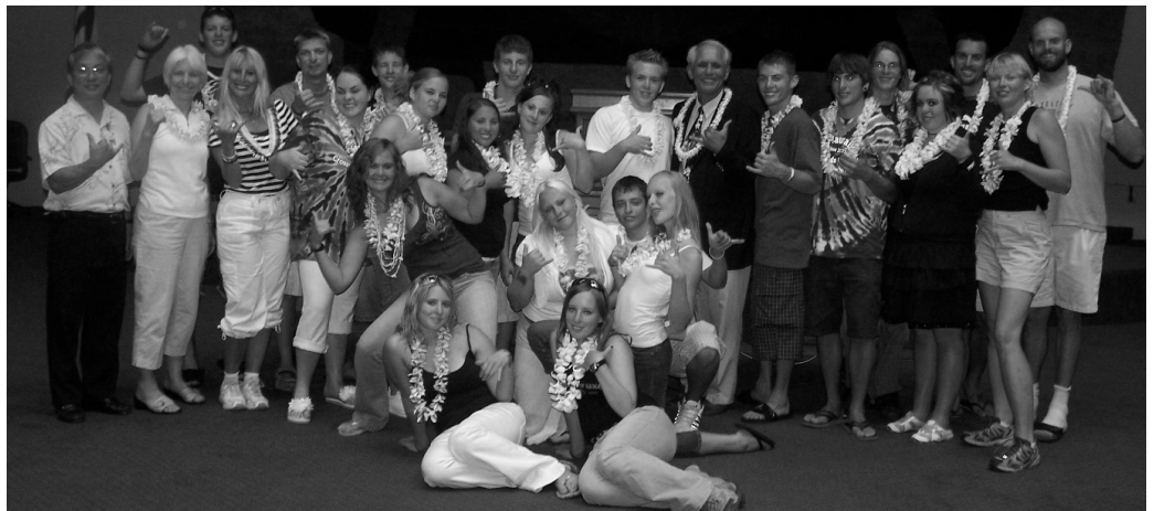
Crossroads Teachers & Students from Minnesota visit the Capitol on 6/19/07.