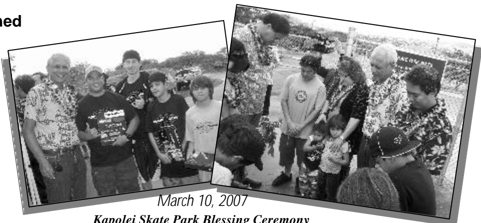
March 10, 2007 Kapolei Skate Park Blessing Ceremony

Mahalo to the Mayor, his staff, the City, and all the community members who worked to make this happen. We look forward to years of safe fun for our youth at this new Kapolei attraction.