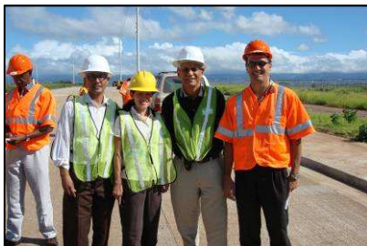
Councilman Apo, Sen. Gabbard, Rep. Pine & Sen. Espero tour the construction site of the North-South Road in Kapolei on Dec. 11th.

Below-left – Sen Gabbard was interviewed by Waipahu Elementary & Intermediate students Charlyn Agony, Talahiva Salakielu, Jeinstene Agony & Gizel Ramos at the capitol on January 9, 2008.