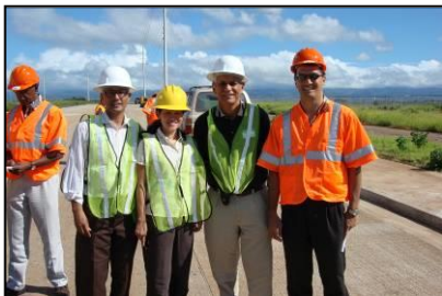
Councilman Apo, Sen. Gabbard, Rep. Pine & Sen. Espero tour the construction site of the North-South Road in Kapolei on Dec. 11th.