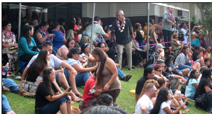
Sen. Gabbard celebrates "May Day 2008" with Makakilo Elementary faculty, students, and families.