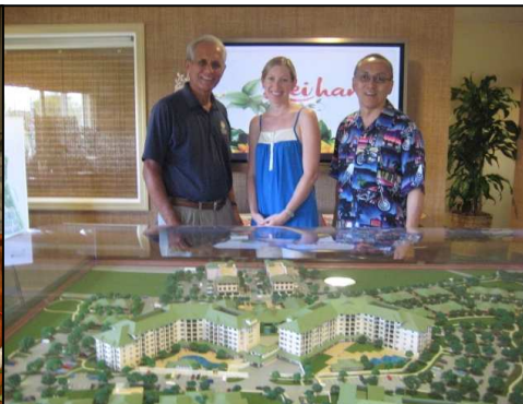
July 11, 2008