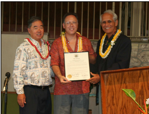
July 13, 2008